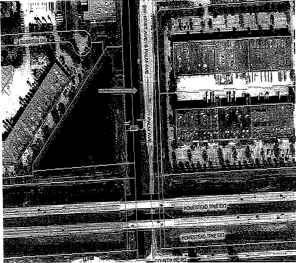
S-2 PUMP STATION - 4000 S.W. 101 ST AVENUE, MIRAMAR