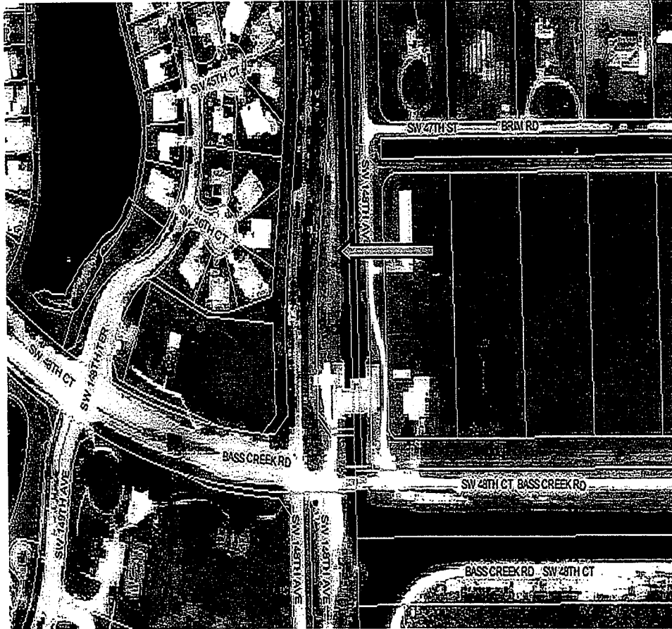
S-3 PUMP STATION - 14801 BASS CREEK ROAD, MIRAMAR