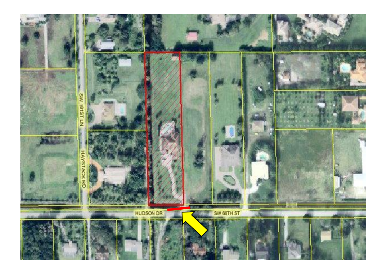
LOCATION 6: ROLLING OAKS – 18091 S.W. 66<sup>TH</sup> STREET, SWR