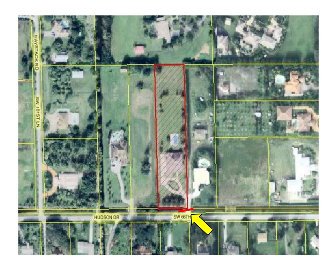
LOCATION 7: ROLLING OAKS – 18001 S.W. 66^{TH} STREET, SWR