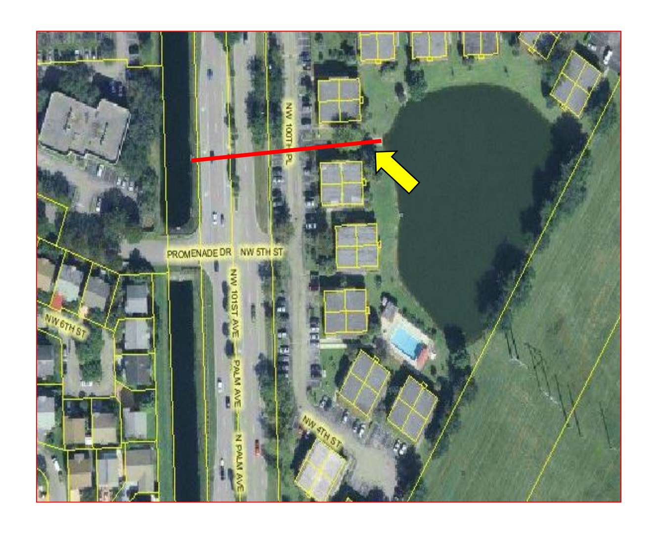
LOCATION 3: PALM PLACE - 555 N.W. 100^{TH} PLACE, PEMBROKE PINES