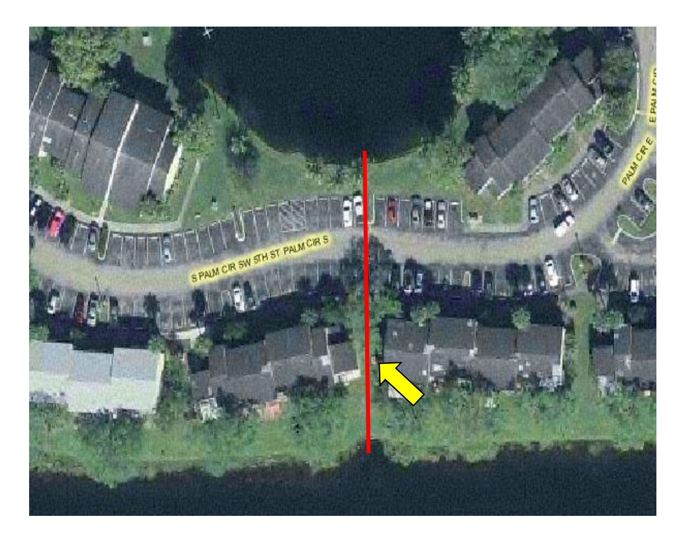
LOCATION 1: PALMS OF PEMBROKE - 9474 PALM CIRCLE SOUTH STREET, PEMBROKE PINES