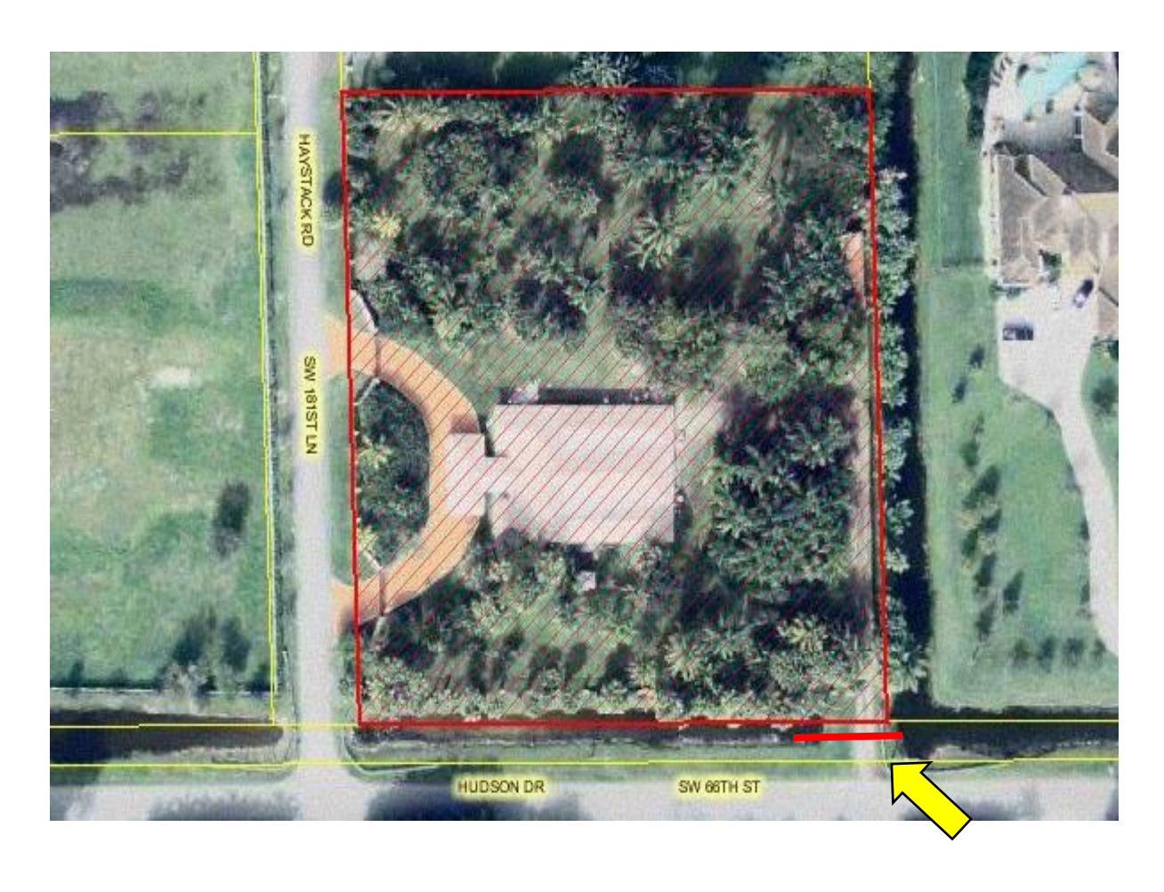
LOCATION 5: ROLLING OAKS - 6520 S.W. 181<sup>ST</sup> LANE, SWR