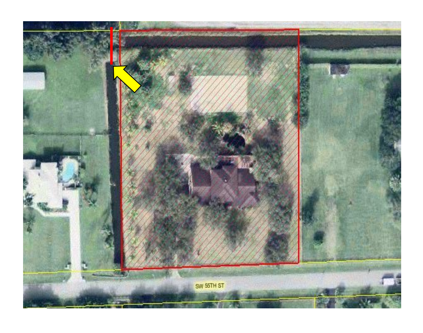
LOCATION 4: ROLLING OAKS - 17933 S.W. 55<sup>TH</sup> STREET, SWR